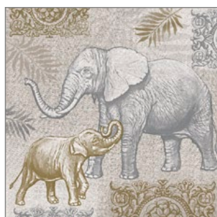
Indian Style Elephants SL_OG_054101