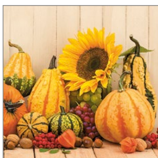
Autumn Pumpkins SL_OG_054001