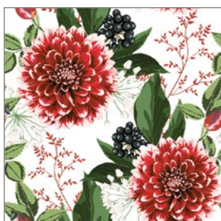
Burgundy Dahlia Flowers SL_OG_053901