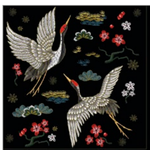
Embroidered Cranes SL_OG_054301