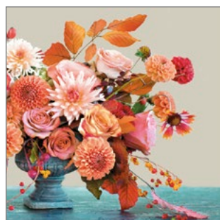
Autumn Bouquet in Vintage Vase SL_OG_053801