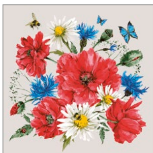
Mix of Wild Flowers with Poppies SL_OG_053601