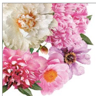
Blooming Peonies SL_OG_053701