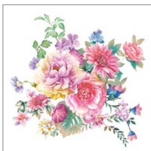
Watercolour Flowers Arrangement SL_OG_053501